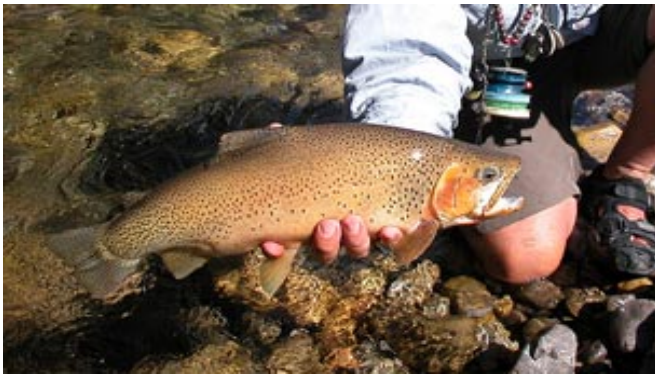
A healthy cutt from a new stream near Fernie

I want to start off this newsletter by wishing everyone a successful 2008. At Home Waters we are coming off our best year ever and we are incredibly excited about some of the new things we will be offering this upcoming season. Many of you have already booked your fishing trip for 2008 and I will be sending out more of these newsletters to let you know what we have planned.