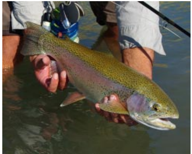
An average sized rainbow from River X

Alberta was also rewarding this year as we gained access to possibly the best trophy rainbow trout stream I have ever seen. I believe we are the only guide service offering this water and I can't even mention the name of the water for very selfish reasons. We are simply referring to it as River X, although the guides are calling it "heaven". My first day here I was with Spencer and the smallest fish and the first fish I caught was about 17 inches. The day