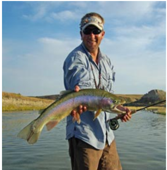
A nice bow taken on a hopper.