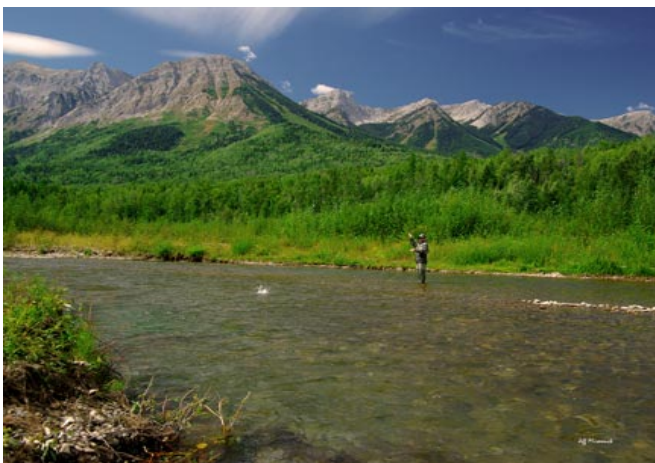
What we are all about, great scenery and fishing

Last year was a real turning point for us. We moved around southeastern British Columbia more than ever and found some unknown new tributaries near Fernie, some that even the guides had never fished. The great part about Fernie is that it is such a new fishery that there are still many unexplored waters. At the end of August last year I had a couple days off